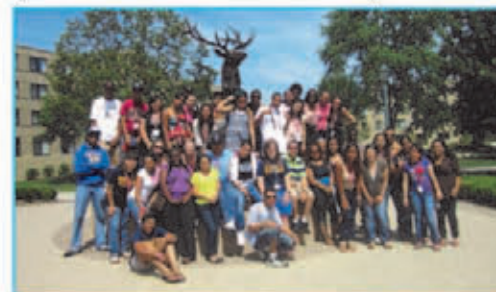
Cristo Rey Network students with the Fairfield University "Stag", the school's mascot.