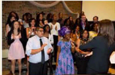
The Senior Choir performs dedication to class of 2011 and those who supported them on the path to graduation.