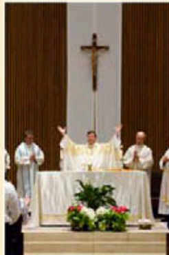
Mass was celebrated by Bishop Lee Piché at the Church of the Holy Name in Minneapolis.