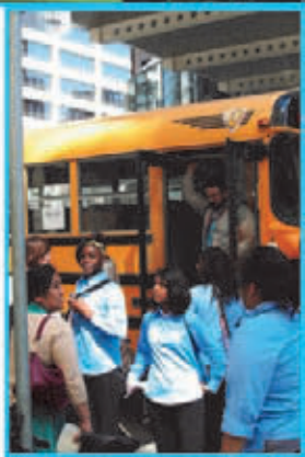
Right: Students and teachers unload bus at stop downtown en route to Hire4Ed work site orientations.